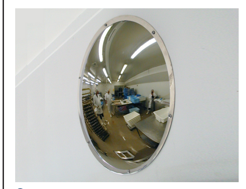
Wide Angle Reflection