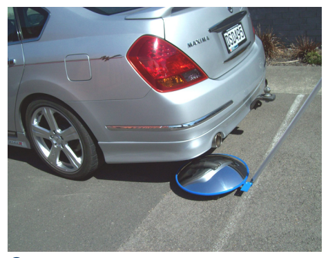
Vehicle Bomb Inspection