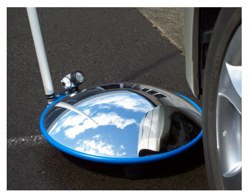
With Base Light Option