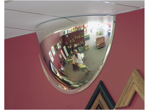
▶ Store Observation