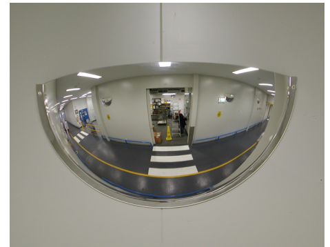
▶ Hospital Bay